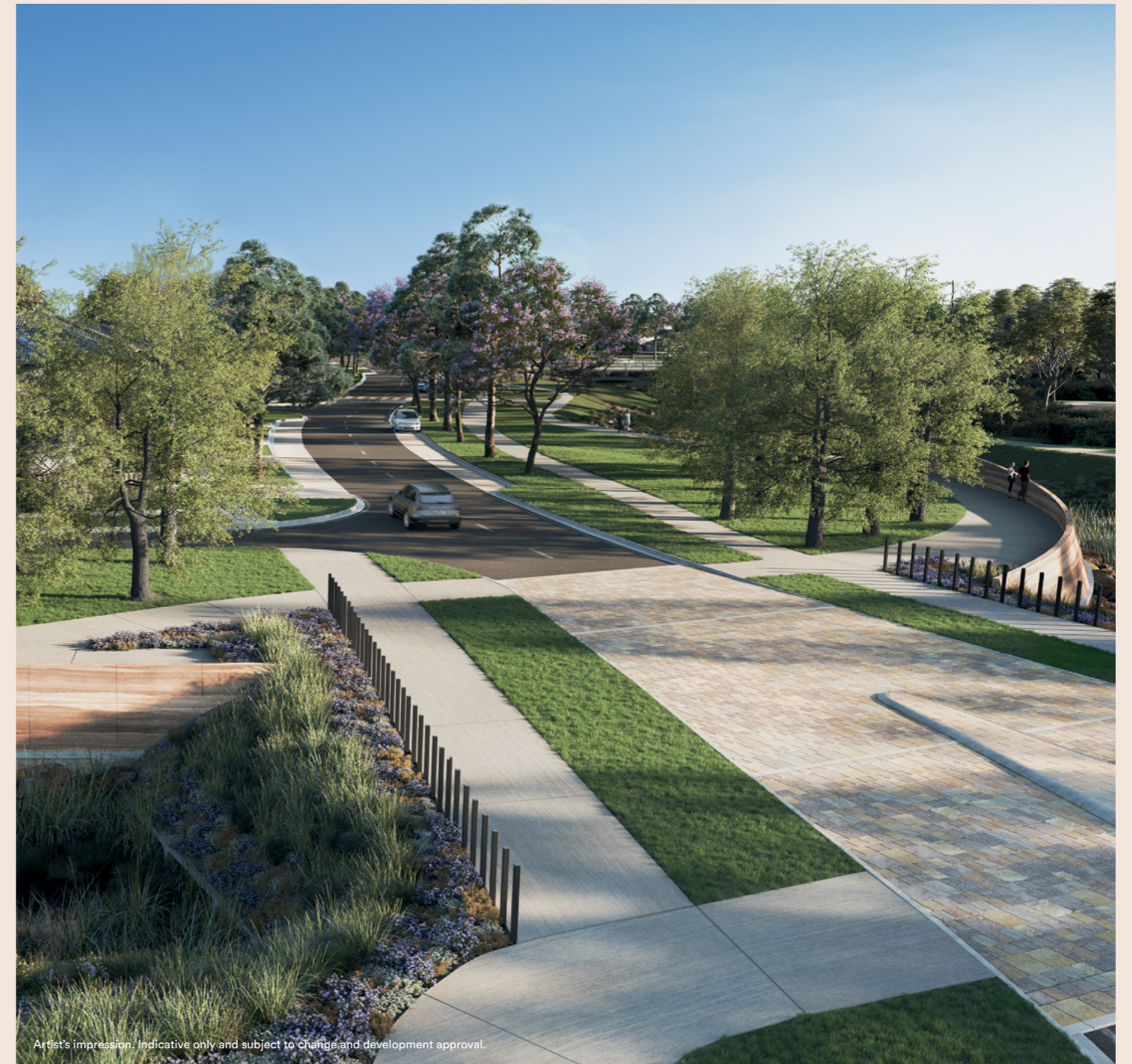
Artist's Impression. Indicative only and subject to change and development approval.